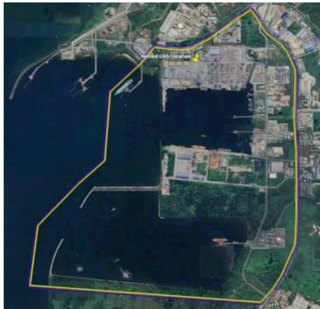
Fig.1. Bintulu Port operation area and Nested UAS location